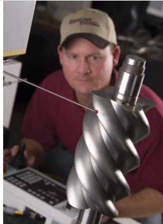
Critical Component Inspections = Quality Products

The CycloBlower stands out as the premium PD blower/vacuum pump in the market. The meshing of two helical lobe rotors synchronized by timing gears provides controlled compression of air for unmatched efficiency and shock-free discharge. State-of-the-art manufacturing techniques, improved assembly methods, and enhanced internal clearances allow the CycloBlower to operate at higher operating speeds for increased flow capacities. For optimal performance, we recommend AEON® PD and AEON® PD-XD (Extreme Duty for high ambient and/or high discharge temperatures) lubricants.