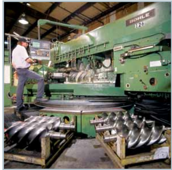
CycloBlower rotors are precision ground using state of the art milling technology.